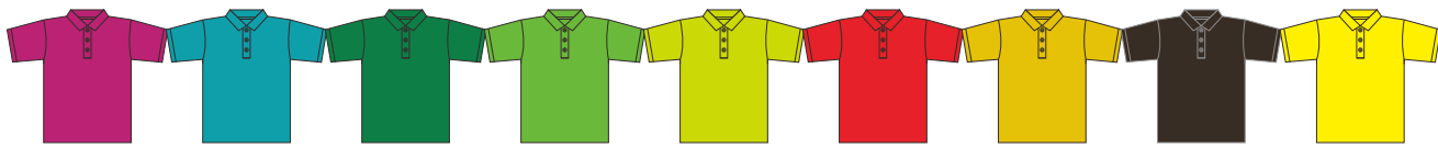
0111 Cerise 0112 Teal 0113 Emerald 0114 Lime 0115 Fluro yellow 0116 Fluro orange 0117 Gold 2# 0118 Brown 0119 Yellow