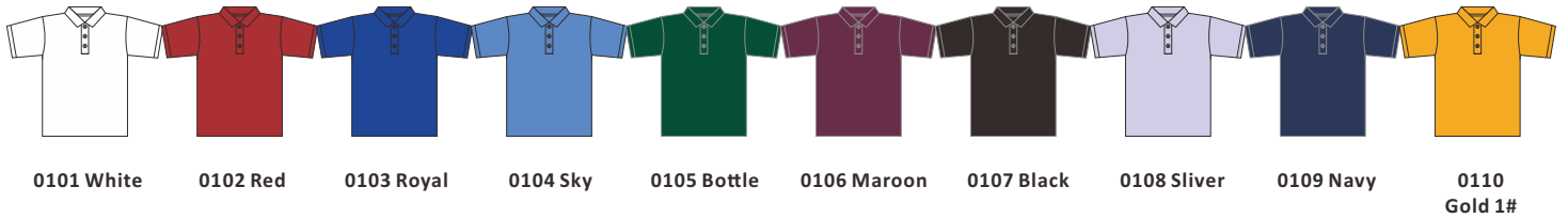
0101 White 0102 Red 0103 Royal 0104 Sky 0105 Bottle 0106 Maroon 0107 Black 0108 Silver 0109 Navy 0110 Gold 1#